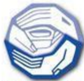
The hand of suffering receives the cup