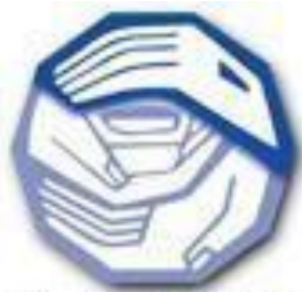
The hand of Christ blesses the cup