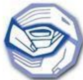
The hand of love offers the cup