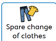
Spare change of clothes