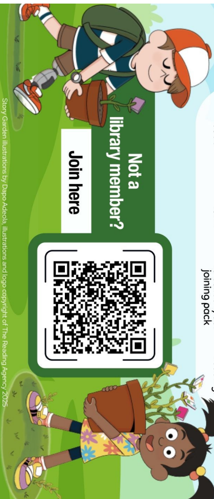
Story Garden illustrations by Dapo Adedoh. Illustrations and logo copyright of The Reading Agency, 2025