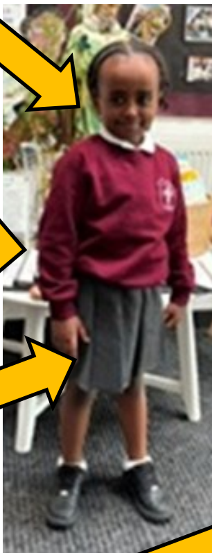
School sweatshirt or cardigan with school logo